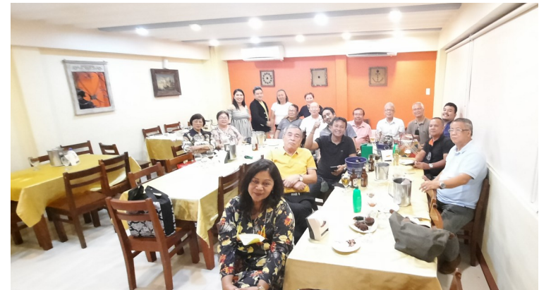
Dec. 08, 2022 Rotary Club of Leyte Gulf Christmas Party held at Philchai Resto.