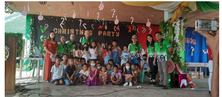
Dec. 18, 2022 Mother and Child Care Project, Gift given to Brgy. Caloogan Children. A joint project of Rotary Club of Leyte Gulf.